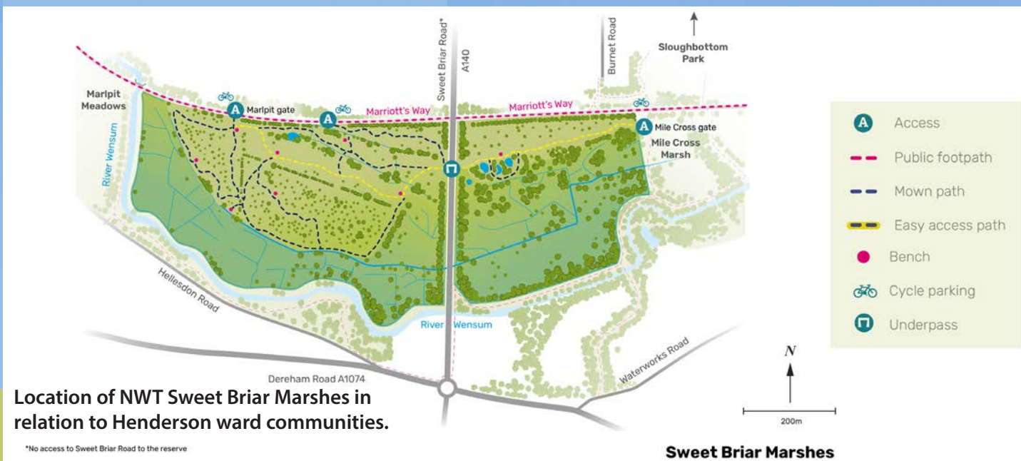
Location of NWT Sweet Briar Marshes in relation to Henderson ward communities.

We're grateful to the Greater Norfolk Growth Board and our project partners Aviva for funding these improvements. Find out more about the work happening at Sweet Briar.