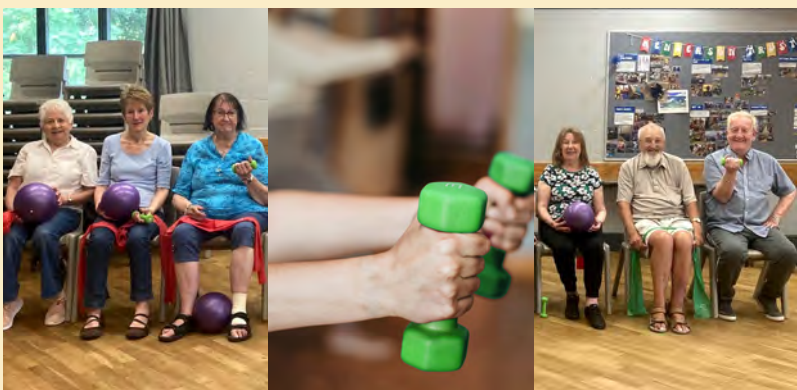
Some current members enjoying a seated workout.