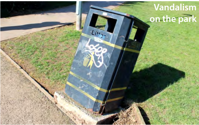
Vandalism on the park

"Even replacing the bins and benches when damaged is expensive, a replacement bin will cost almost £400 and takes a full day's work to replace."