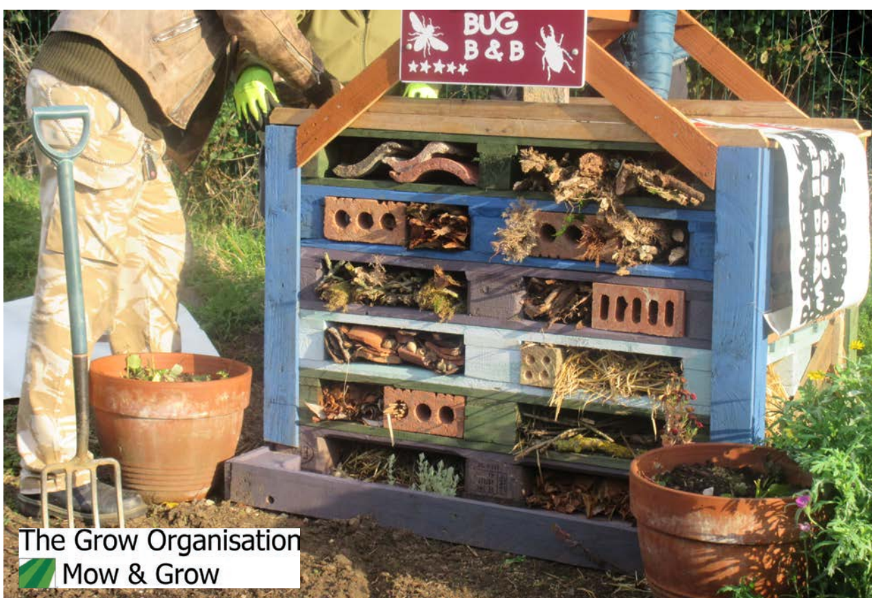
The Grow Organisation Mow & Grow